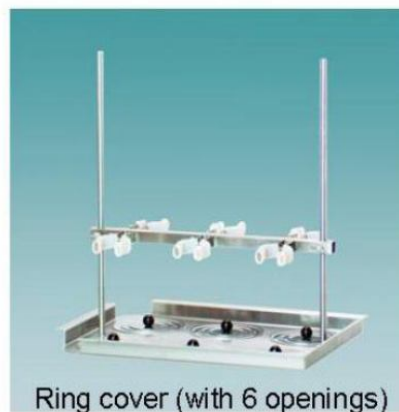
Ring cover (with 6 openings)